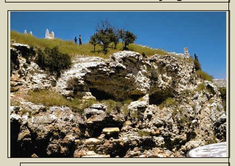
1961 photo of Golgotha before it is spoiled by buses and construction.

This writer has an admitted bias toward Golgotha and the Garden Tomb, however, there is room for both. Each of these Holy Sites have been assessed for their attributes including Pros and Cons. You be the judge.