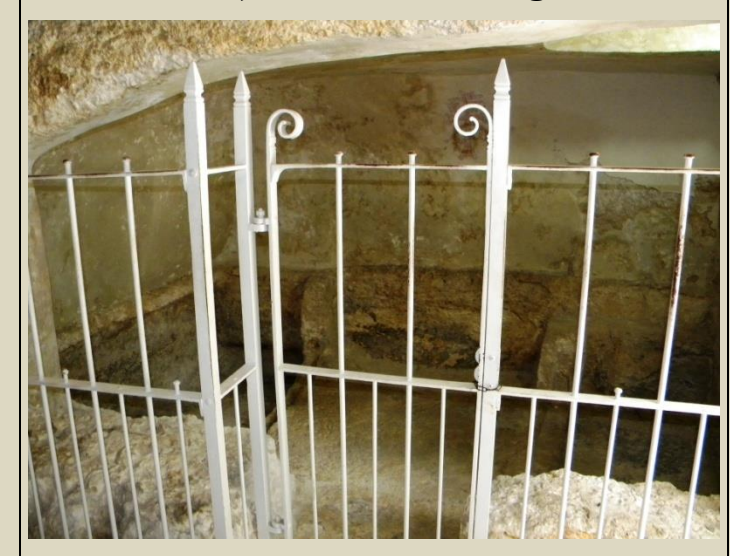
The View inside the Garden Tomb