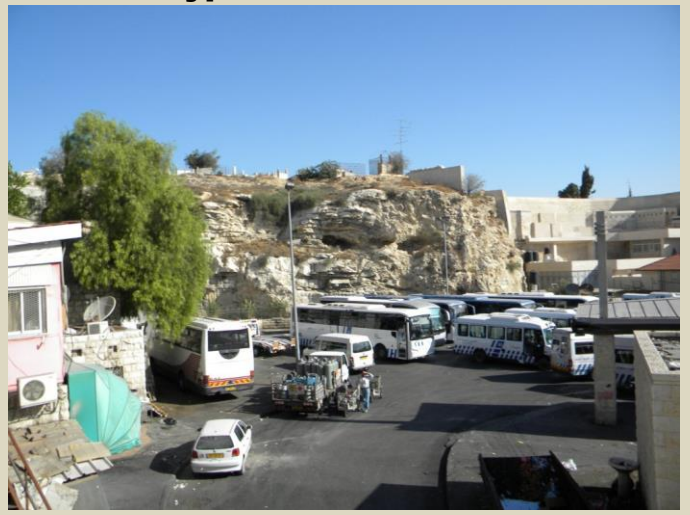
2011 - View of vehicular entry to East Jerusalem Bus Station with a view of Golgotha beyond.

Although it cannot be proven that Golgotha is The true location of "The Crucifixion", it is likely that evidence such as cross holes can be found to prove that this is a Site of Ancient Roman Crucifixions. Archaeologists' believe that the crosses were actually located at the street level of Nablus Rd which is typical of Roman executions.